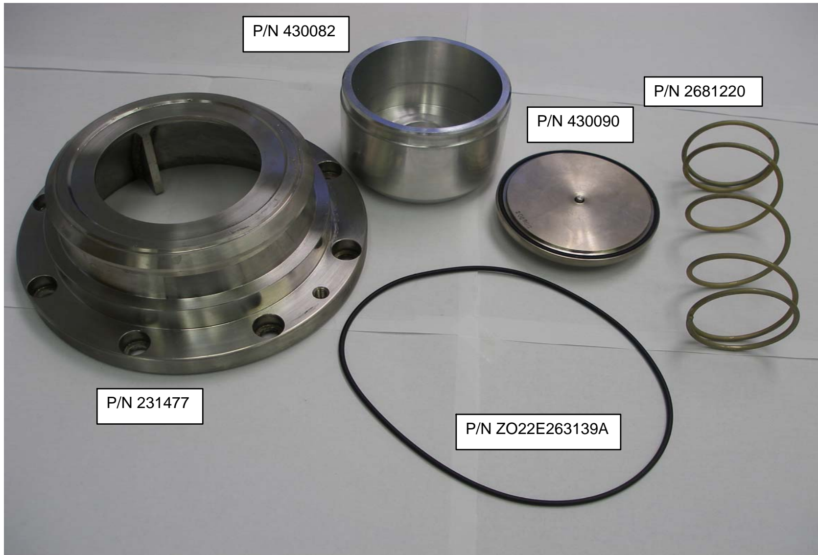
Figure 3: Upgrade Kit P/N 80318 for PVMY1000M1 and PVMY1000M2 to PVMY1000M3 standard